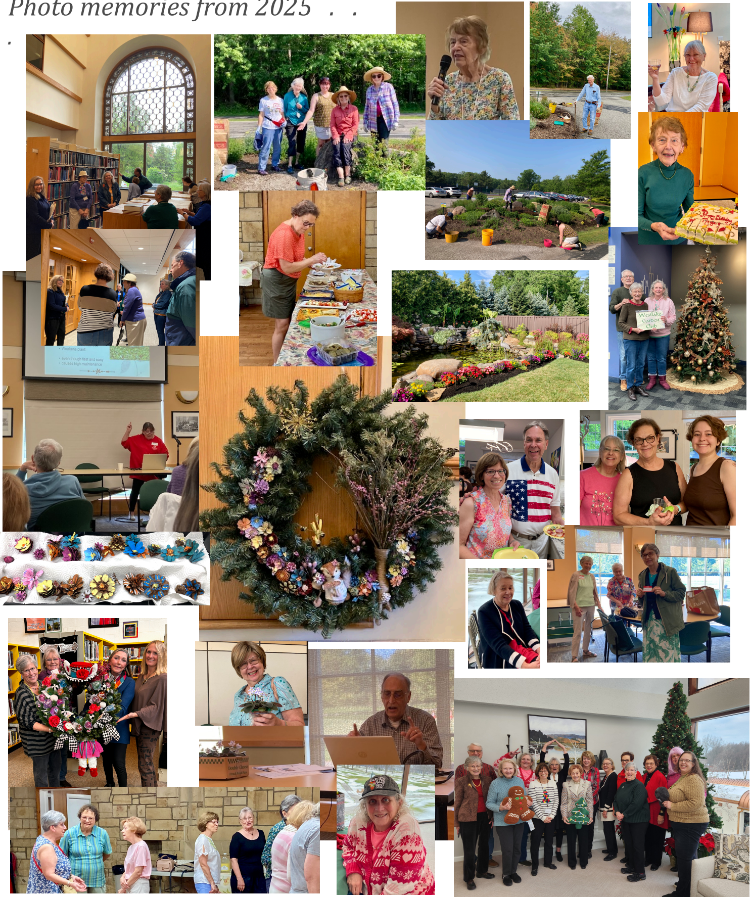
Photo memories from 2025 . .