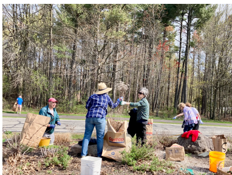
Weeding Wednesday, April 23, 2025

P. S. Oak, a keystone species, supports more life-forms, including fungi, insects, birds and mammals, than any other North American tree genus.