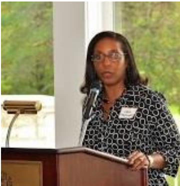
Gardenview Horticultural Park