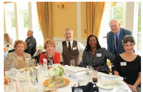
Arbor Day 2013