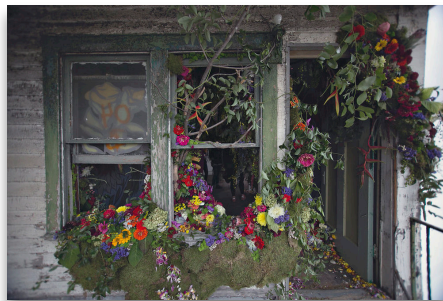
From Blight to Bloom