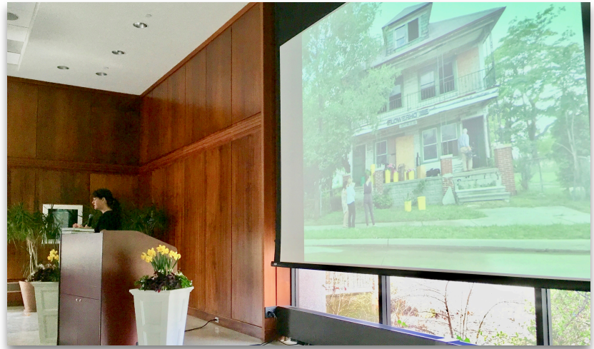
Slide of vacant house used for the art installation in Detroit, MI.