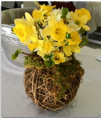
Table decor at the CBG

Here's the Flower House website if you'd like to see photos or hear more about the exhibit, the book or the park that has been created on the site.