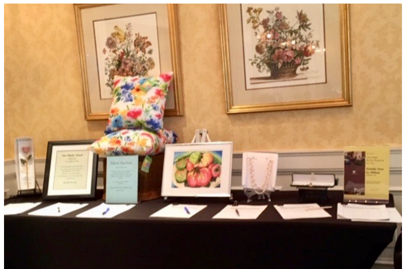
Silent Auction featuring a watercolor by Cathy Garlitz